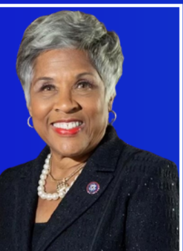
CONGRESSWOMAN JOYCE BEATTY

MANAGING PARTNER & CEO, ASLAND CAPITAL PARTNERS LLC