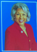
CONGRESSWOMAN JOYCE BEATTY U.S. REPRESENTATIVE, OHIO 3RD CONGRESSIONAL DISTRICT & CHAIR, CONGRESSIONAL BLACK CAUCUS (CBC)