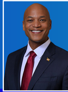
GOVERNOR WES MOORE

FOUNDER, CHAIRMAN & CEO, AVANATH CAPITAL MANAGEMENT, LLC,